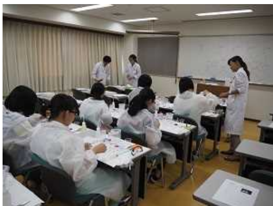
Welcome to Chemistry: Experiments with The Chemical Society of Japan

uncertain about. I was also able to think beyond immediate matters, such as whether to pursue the arts or the sciences and what university to choose, and consider career choices a little further away in time.”