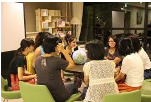
Students engaged in international exchange