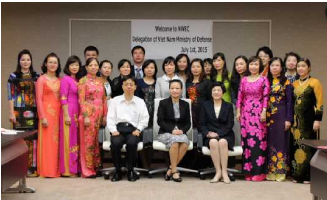
Commemorative photo with the delegation from the Ministry of Defense of the Socialist Republic of Vietnam

A discussion with NVEC staff was followed by a tour of NVEC's Information Center for Women's Education, seminar complex and Japanese tea ceremony house; and lunch at the restaurant at the Center where an event was underway. An impromptu performance of traditional Vietnamese songs by a member of the delegation provided an opportunity for deeper exchange with other NVEC users.