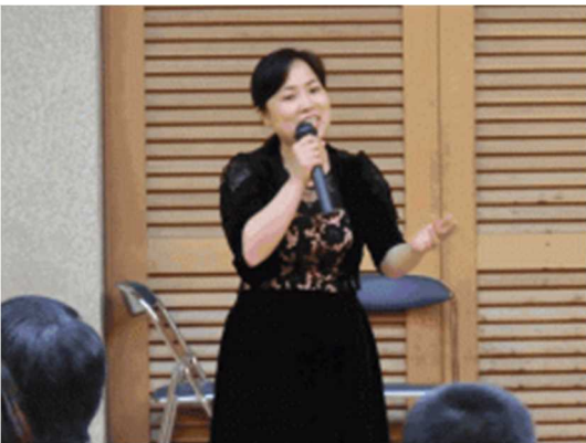
Performing traditional Vietnamese songs at the restaurant at NVEC