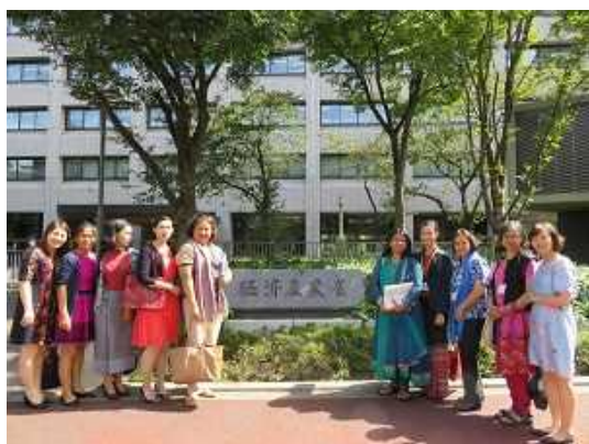
Visit to the Ministry of Economy, Trade and Industry

In the first half of the seminar, participants toured the Information Center for Women’s Education and the Women’s Archives Center at NWEC, presented country reports and held a poster session, and shared information on the latest gender equality policies and challenges facing support for women’s economic independence in their respective countries.