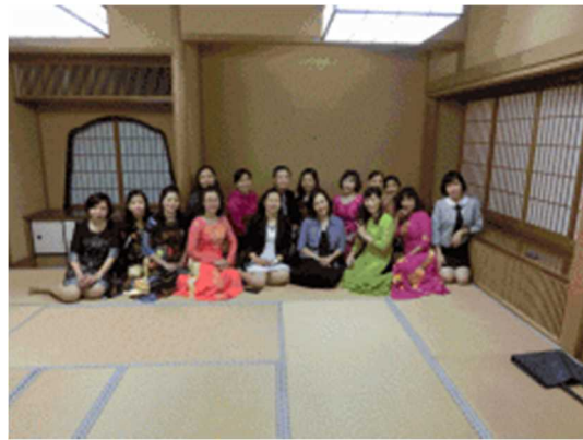
The delegation in the Japanese tea ceremony house