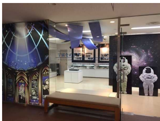
Exterior view of the exhibition room

The FY2015 Special Exhibition “Reaching for the stars: from women who made challenges to women aspiring to make challenges,” is being held in the exhibition room in the Women’s Archives Center (1F, Main Building) from July 31 through December 20.