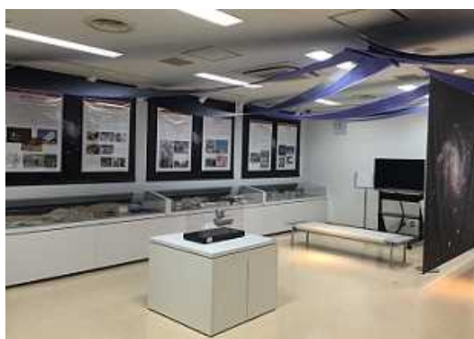
Interior view of the exhibition room

The exhibition is the eighth in a series that considers gender equality in Japan from the experiences of women who have made challenges in various fields. Various exhibits are used to introduce the paths taken by a number of women, both Westerners who made significant contributions to research in astronomy in the 18 th and 19 th centuries and Japanese currently working at JAXA (Japan Aerospace Exploration Agency) or the