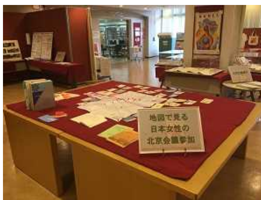
Exhibit of materials of the Fourth World conference on women