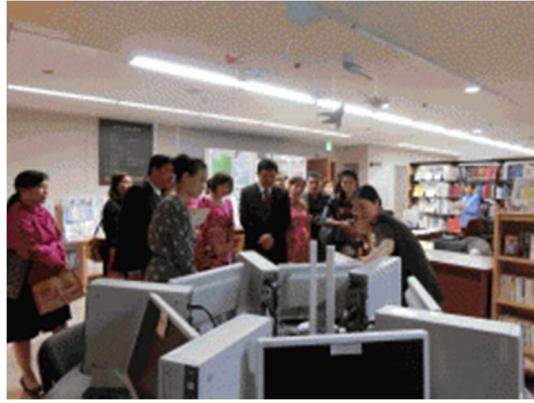
Touring the Information Center