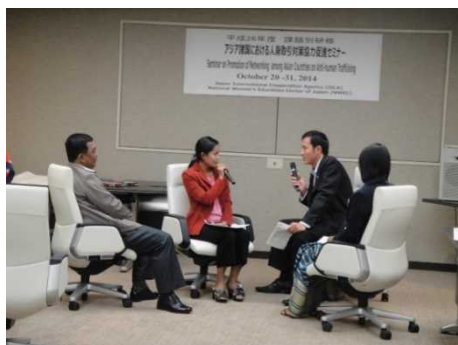
Role-play workshop at NVEC

Representatives of relative ministries, the International Organization for Migration, embassy staffs from the participants' countries in Japan, private support organizations and other intellectuals were invited to attend the outcome session held on the final day where participants reported on what they had learned