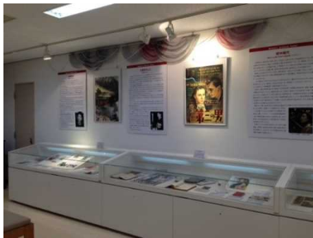
Inside the exhibition room

Active in various roles including bringing international film masterpieces to Japan and executive production