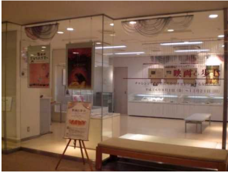
Exterior view of the exhibition room

to make challenges” is being held in the Women’s Archives Center’s exhibition room (1F, Main Building).