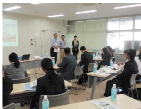
Explanation of the Hamamatsu Foreign Resident Study Support

Held around the theme "Thinking about your career is tantamount to thinking about your life", this two-day residential seminar gathered 19 women students from various universities and, through a series of lectures, panel discussions