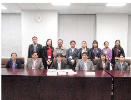
Lecture by related ministries and agencies

Organized in cooperation with the Japan International Cooperation Agency (JICA), the seminar targeted individuals involved in initiatives to combat trafficking in persons (TIP) in the Asia Pacific region, and was attended by Myanmar and Vietnamese counterparts in a JICA project to combat TIP, and 12 national and local government officers from the Philippines, Cambodia, and Laos.