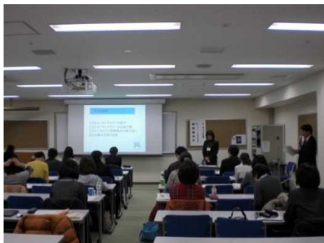
Participants on the Basic Course

Twenty-seven individuals from throughout Japan (including seven university library staff) attended the Basic Course held on December 10 & 11, and ten attended the Practical Course held on December 11 & 12 (four attended both).