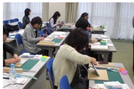
Participants on the Practical Course

The Basic Course comprised not only lectures outlining women's archives and providing information on copyright theory and the storage and use of paper materials and films, but also reported on a number of case studies of archives being made publicly accessible by archive facilities. Participants were also invited to join an optional tour of NWECC's Women's Archive Center and a social event to promote networking among the lecturers and participants.