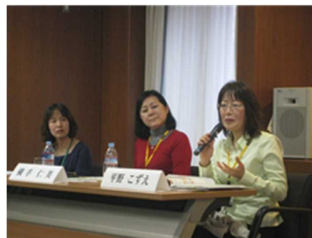
The three panelists

In a lecture entitled “The environment surrounding working women as seen from a comparison of international data” , the director of NVEC’s Office of Research and International Affairs spoke about the current situation in terms of gender equality in Japan and issues women face while working based on a number of opinion surveys and international comparative data.