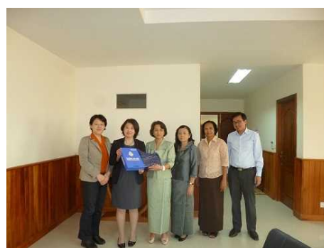
Staff with Dr. Phavi, Minister of Women’s Affairs (center)