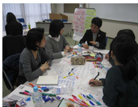
Getting advice from professional women

Post-seminar questionnaires included comments such as “Hearing the opinions of both my contemporaries and working women encouraged me think about a lot of things, and made me feel like a new person” and “The seminar inspired me to revisit my thoughts about my future and consider them earnestly.” Participants’ heightened awareness about their own futures could be seen at various points throughout the two-day program.